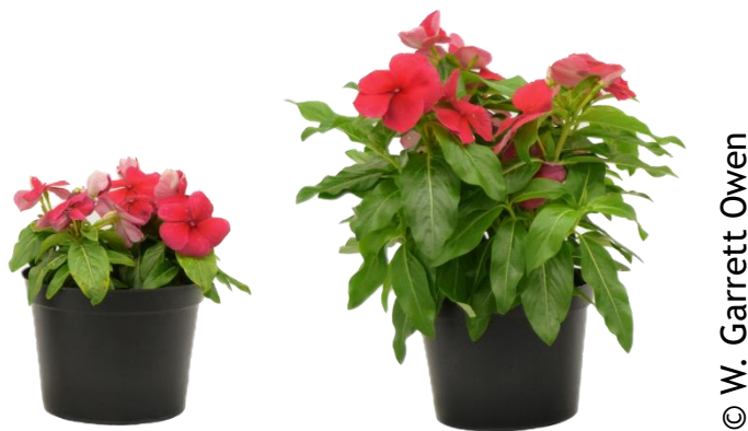
Figure 3. Vinca ( Catharanthus roseus ) exhibiting stunted plant growth (left) compared to a 'normal' plant (right) taken from the crop that was not accidentally drenched with 3 ppm (0.0125 mg active ingredient per pot) paclobutrazol.